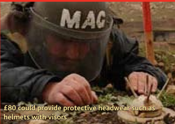
£80 could provide protective headwear such as helmets with visors