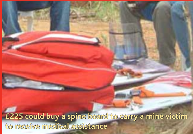
£225 could buy a spine board to carry a mine victim to receive medical assistance