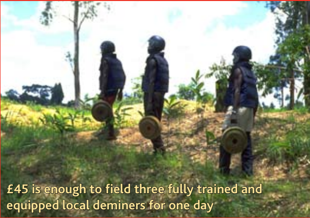
£45 is enough to field three fully trained and equipped local deminers for one day