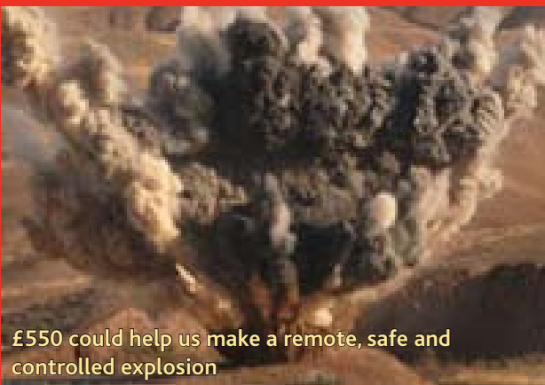
£550 could help us make a remote, safe and controlled explosion