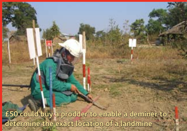
£50 could buy a prodder to enable a deminer to determine the exact location of a landmine