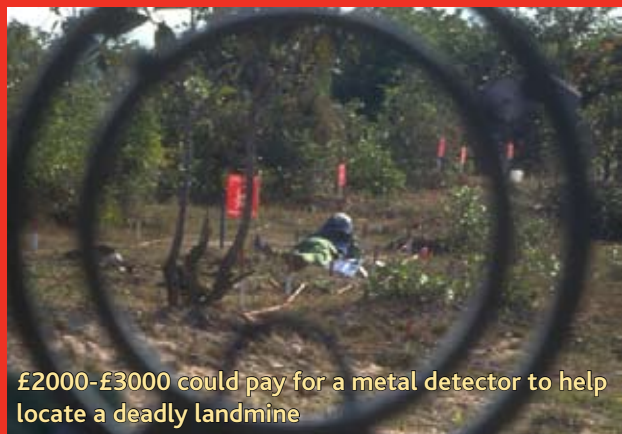
£2000-£3000 could pay for a metal detector to help locate a deadly landmine

Or we could just put your hard earned donations towards destroying weapons in war torn countries, to transform minefields into safe agricultural land, to educate people on the dangers of living in areas contaminated by weapons, to enable other emergency services to deliver their services in safety, to provide employment for some of the world's poorest people. Simply put, we make safe land available for building homes, schools, health centres or a place for children to play out of danger.